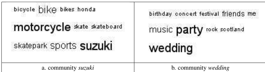
Figure 3: Examples of computed tag clouds. The displayed tags are the most representative of communities according to the centrality criterion.

Communities calculation captures cohesive sub-hypergraphs which unveil different associations of words corresponding to common sense shared by users. A tag with a high centrality means that people frequently use it in different contexts (presence of this hypernode on many shortest hyperpaths in the initial hypergraph). Therefore, the most central tags within a community are precisely the tags which reveal, through their usage, an emerging collective meaning (Figure 3). We can observe a consensus in the use of tags inside each tags community which seems to confirm the hypothesis of social scientists (Figure 3).