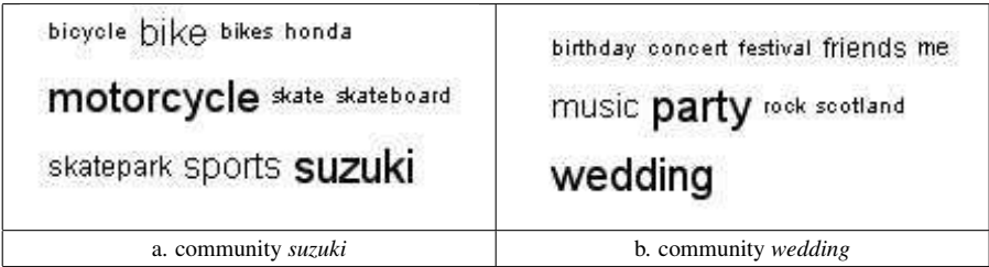
Figure 3: Examples of computed tag clouds. The displayed tags are the most representative of communities according to the centrality criterion.

Communities calculation captures cohesive sub-hypergraphs which unveil different associations of words corresponding to common sense shared by users. A tag with a high centrality means that people frequently use it in different contexts (presence of this hypernode on many shortest hyperpaths in the initial hypergraph). Therefore, the most central tags within a community are precisely the tags which reveal, through their usage, an emerging collective meaning (Figure 3). We can observe a consensus in the use of tags inside each tags community which seems to confirm the hypothesis of social scientists (Figure 3).