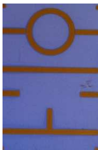
Fig.1 – Microstrip resonators on ESL41110 substrate.

The third section in this paper describes the free space method; Broadband measurement results from 75 to 110 GHz are obtained by using the quasi optical bench. The extracted real part of the complex permittivity is found to be about 4.2 and the \tan \delta is about 0.018 in the 75 – 82 GHz band.