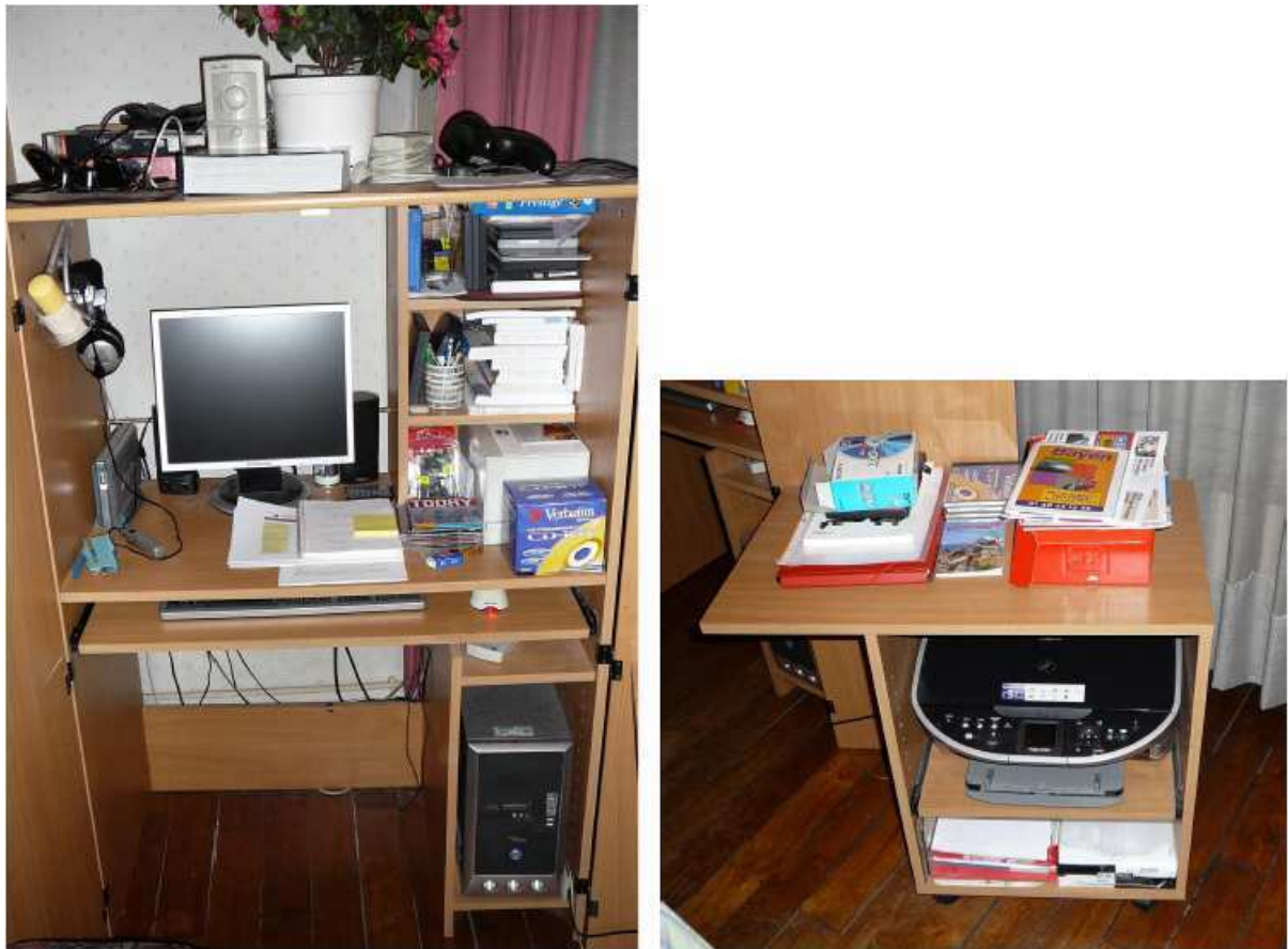
Figure 2: The domestic multimedia space of a teenager in de Swarte & al. (2007)