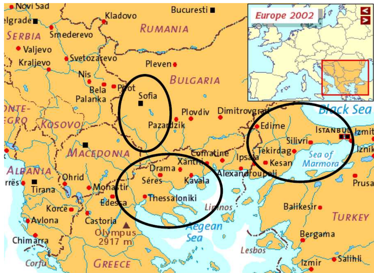
Figure 1: Location of the Three Metropolitan Regions