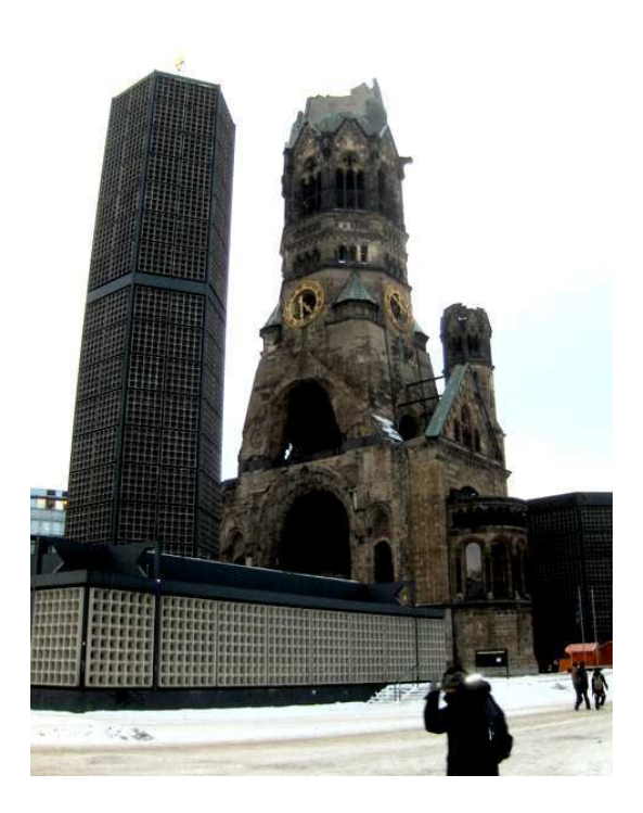
Photograph 2: Berlin, Gedächtniskirche (J.-L. Piermay, 2010).

However, in many cases, it seems that this materialized memory alone does not necessarily lead to risk awareness. Two main reasons can explain this insufficiency. First, size matters: small marks on street walls and massive preserved ruins do not have the same effect on perception. Moreover, a ruined monument loses its functionality, and this sort of incongruity raises questions when people pass by, whereas small traces such as tsunami landmarks or