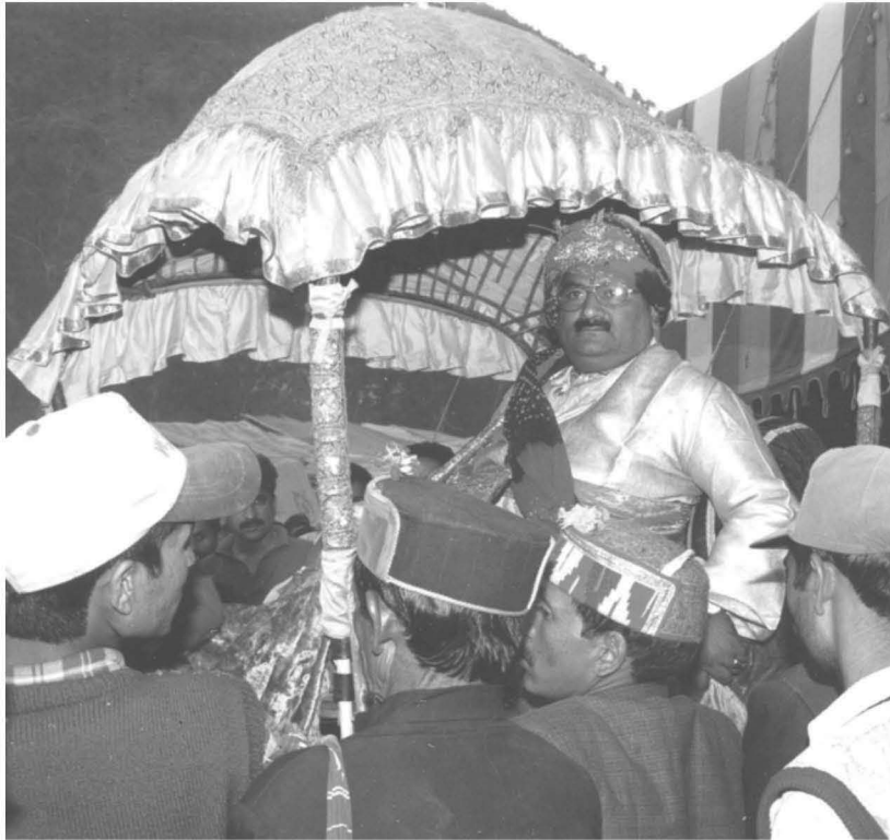
Fig. 2: The raja sitting in his royal palaquin is carried all around the town during Dasherā.