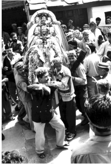
Fig. 3: The Raja's son starts to run violently while carrying Hadimba's palanquin.

This idea is also expressed in ordinary interactions. For instance, once I saw the rājā 's son and his daughter meet the medium of Hirmā devī – a tall and corpulent man, ill-shaven, belonging to a low caste – and say, while addressing his daughter, "Come here, baby! Come to say 'Hallo' to your grandmother!"