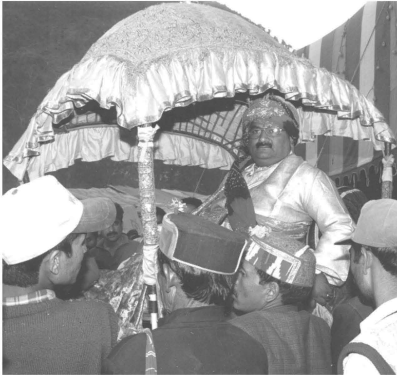
Fig. 2: The raja sitting in his royal palaquin is carried all around the town during Dasherā.