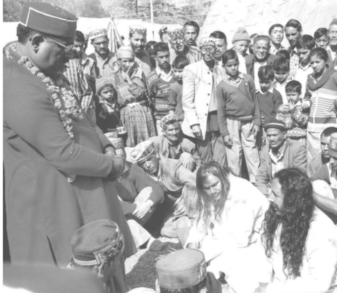
Fig. 4: The raja consults the mediums of two village goddesses.

urged the rājā to solve a conflict between two groups of villagers competing for an honorific position to be assigned to the palanquins of their respective deities (Berti, forthcoming). One village accused the rājā of favouring the other deity only because its jurisdiction was in a constituency where the rājā 's brother was competing for elections. By contrast, their own deity was in a reserved constituency from where the rājā 's brother could not get any votes. The rājā had started to consult the administrators of the two competing gods to try to put an end to the dispute but the gods, speaking through their mediums, wanted the problem to be solved by the deities themselves and asked the rājā to organize a jāgtī pūch .