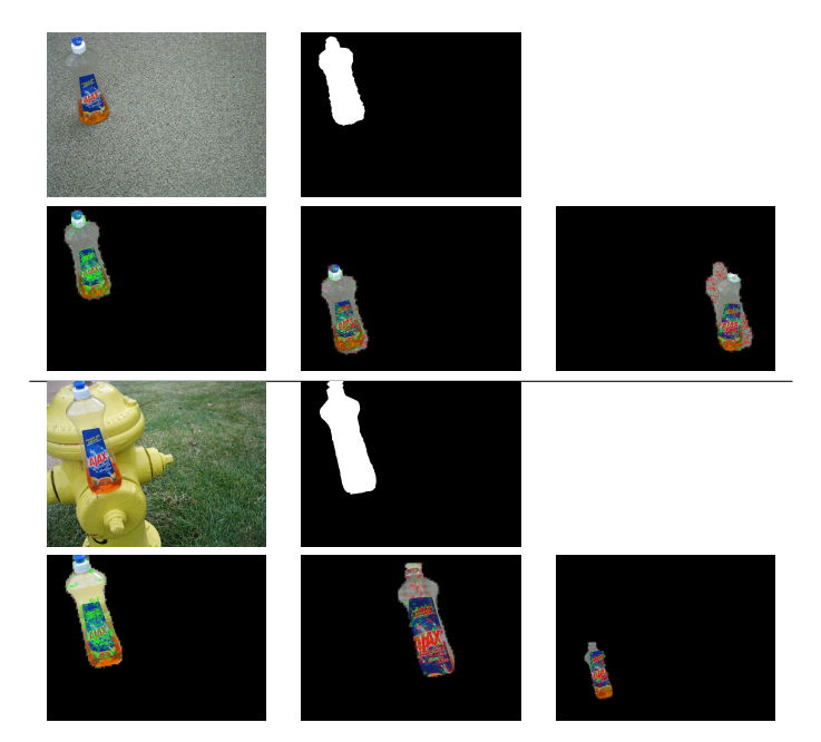
Figure 2: Examples of queries and matched transformed masks

This kind of data often contains several takes of the same scene, maybe with a different camera angle. We expected that images between these takes could be quite similar. Hence the use of context such as global BORW signatures for example frames and DB was justified. Furthermore, if object based query is considered, the mask of query could