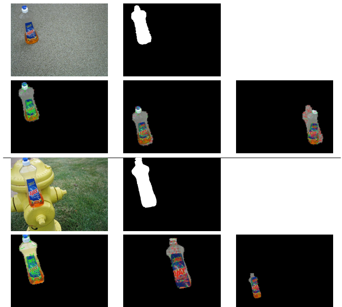
Figure 2: Examples of queries and matched transformed masks

This kind of data often contains several takes of the same scene, maybe with a different camera angle. We expected that images between these takes could be quite similar. Hence the use of context such as global BORW signatures for example frames and DB was justified. Furthermore, if object based query is considered, the mask of query could