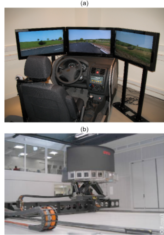
Figure 1: (a) IRCCyN driving simulator. (b) Ultimate Renault driving simulator

TRW© active steering system for realistic "scale one" force-feedback. Transmission was carried out using an automatic gearbox. Vibrators are installed underneath the driver seat and upper position of the steering column to render engine noise and vibrations. The audio system reproduces the audio environment for an interactive vehicle. It comprises an amplifier, four speakers and a subwoofer.