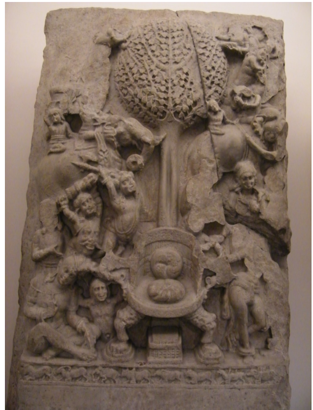
Figure 10. Empty Lion Throne with Buddha Footprints, Stone Slab, Amarāvati style, 2 nd Century C.E., Musée Guimet, Paris, France