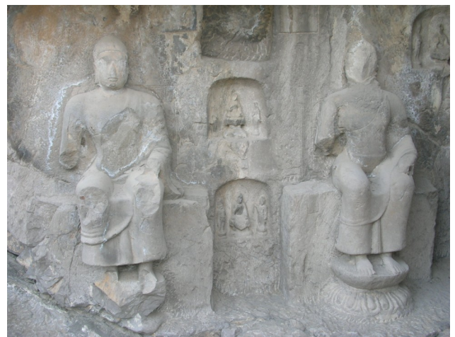
Figure 8: King Udayana Buddha Images, High Relief, Stone, 7 th Century, Longmen Caves, China