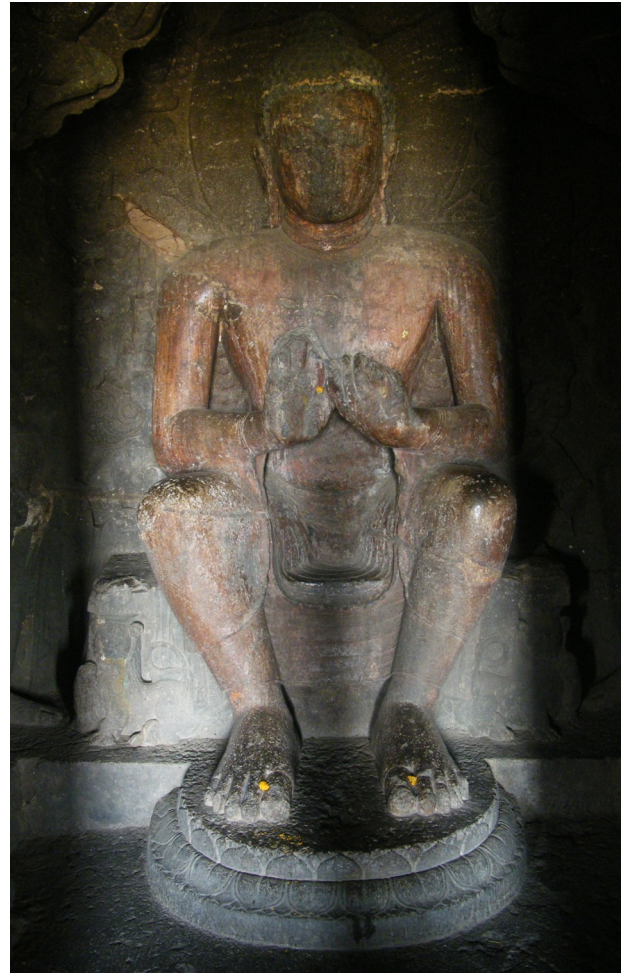
Figure 4. Pendant-Legged Buddha in dharmacakramudrā, High Relief, Stone, 6 th -7 th Century (?), Aurangābād, Cave 6, India