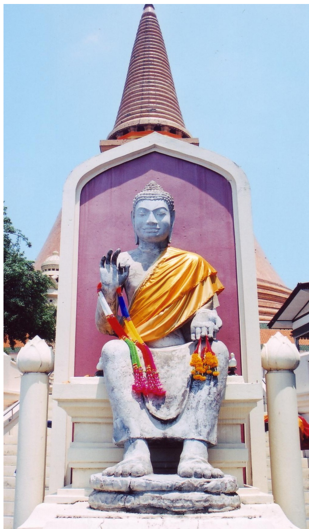
Figure 1. Pendant-Legged Buddha in vitarkamudrā, Stone, 7 th -8 th Century, Phra Pathom Chedi, Nakhon Pathom, Thailand

consideration the few extant models that seem to have reached the hands of private collectors, it is conceivable to assume that perhaps the diffusion of this iconography was once more important in the region. 8 As for Burma, only a few small bronze images and terracotta plaques seem to depict this iconography (Mya 1961, II: Plates 53-54; Luce 1985, II: Figure 76b; Moore 2007: 20-21, 164, 198, 222), while in Java, there are more examples, not only in bronze (Fontein 1990: 183-185; Woodward 1988: Figure 12) but also stone (Figure 3). 9 Is this iconography, however, unique to Southeast Asia?