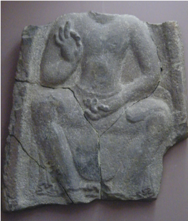
Figure 5. Pendant-Legged Buddha in vitarkamudrā, Low Relief Fragment, Stone, 7 th -8 th Century (?), Phimai National Museum, Thailand