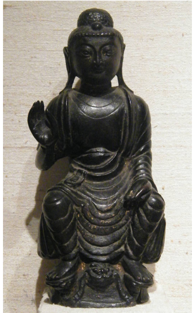
Figure 6. Pendant-Legged Buddha in abhayamudrā, Bronze, Tang Period Style, 7 th -8 th Century (?), Pacific Asia Museum, Pasadena, USA