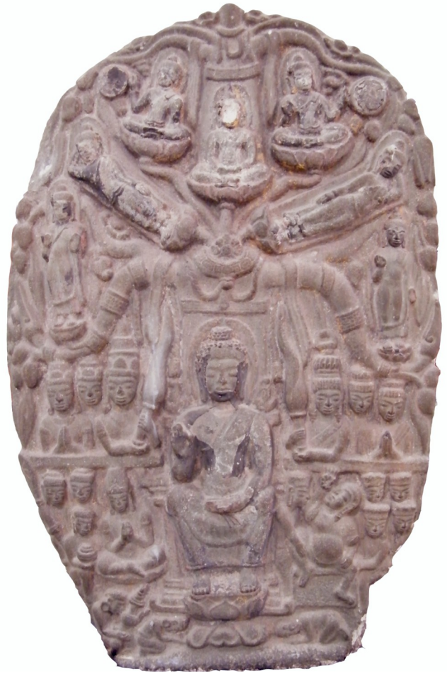
Figure 13. The Great Miracle at Śrāvastī, Low Relief, Stone, 7 th -8 th Century, Bangkok National Museum, Thailand