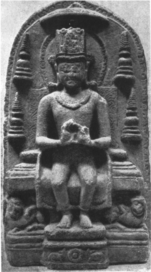
Figure 14. Crowned Buddha seated with Legs Pendant, High Relief, Stone, Pāla Period Style, 10 th -12 th Century (?), Boston Museum of Fine Arts, USA (Bourda 1949: 311 Figure 5)

able to trace, the earliest occurrence was probably penned by German Albert Grünwedel in his “Handbuch” entitled Buddhistische Kunst in Indien , first published in 1893. 17 This terminology – “à l’eupéenne” – was then taken over by Alfred Foucher (1894: 348) and given preeminence in his pioneering writings on Buddhist art (e.g. 1905: 49 n.1; 1909: 26 Plate 4).