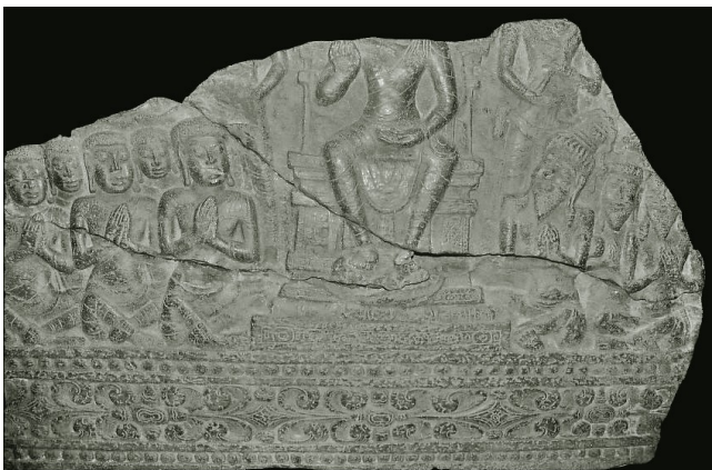
Figure 7. Enthroned Buddha in vitarkamudrā, Low Relief, Stone, 7 th -8 th Century, Phra Pathom Chedi National Museum, Nakhon Pathom, Thailand