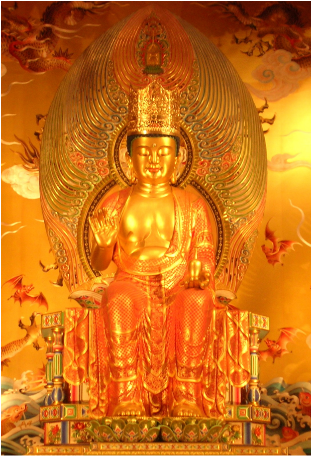
Figure 15: Pendant-Legged Buddha Maitreya with a Removable Crown and a Water Bottle, Copper Alloy, 21 st Century, Tooth Relic Temple, Singapore

identify the scene and the Buddha Śākyamuni as such but simply as “a king seated on a throne [and] speaking to an audience” (1895: 121; also Hennequin 2009: 138-139 Figures 2-3). Actually, this mode of sitting was already fairly common in Gandhāra in the time of the Kuṣāṇas and was not only allotted to kings (Figure 9) but to bodhisattvas and other divinities as well, perhaps echoing Greek and Parthian traditions (Rosenfield 1967: 186-188).