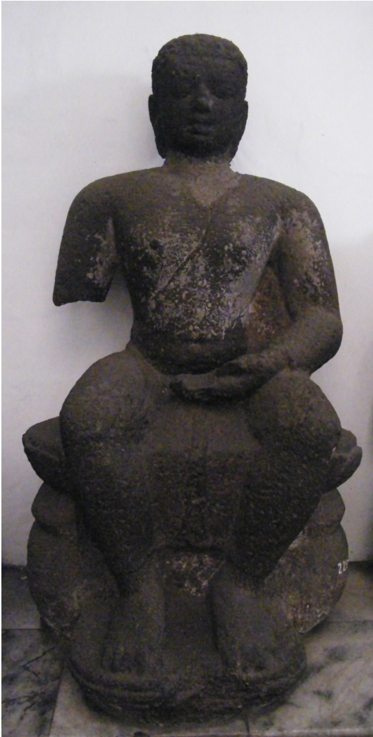
Figure 3. Pendant-Legged Buddha in abhaya- or vitarkamudrā, Stone, 8 th Century (?), Museum Nasional Indonesia, Jakarta