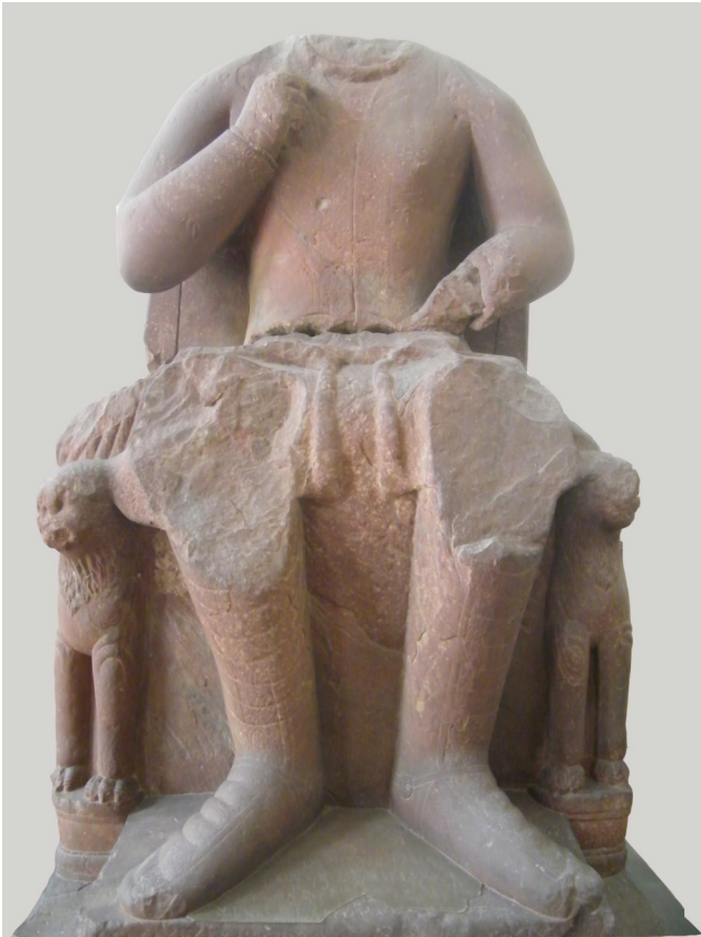
Figure 9. Kuṣāṇa Emperor (Vima Kadphises?) on a Throne, Stone, 1 st or 2 nd Century C.E., Mathurā Archaeological Museum, India