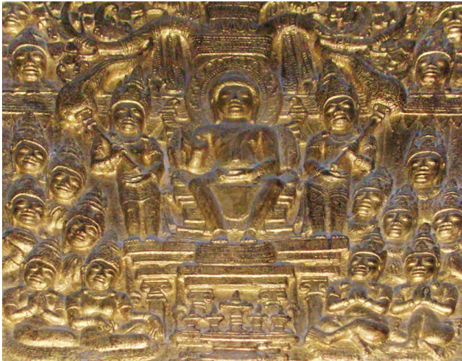
Figure 12. Enthroned Buddha in Trāyastriṃśa, Low Relief, Stone, 7 th -8 th Century, Wat Suthat, Bangkok, Thailand