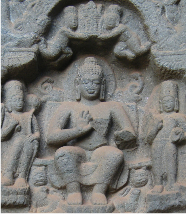
Figure 11. Enthroned Buddha (on Mount Meru?), Topped by Celestials carrying a Crown, High Relief, Stone, ca. 6 th Century, Karli (in situ), India