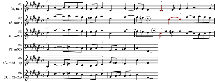
Fig. 6. Some subject occurrences in Fugue #8 in D# minor. The occurrence #1 is the first one, and is similar to 16 occurrences, sometimes with diatonic transpositions. In the occurrence #2, the last but one note of the subject (circled E) has not the same length than in the other occurrences (and this is forbidden by our substitution function \delta ). In the occurrence #3, a supplementary note (circled G) is inserted before the end of the subject, again preventing the detection if the true length of the subject is considered. Moreover, the occurrences #3, #4 and #5 are truncated to the head of the subject, and lead to a false detection of subject length.