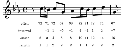
Fig. 1. A monophonic sequence of notes (start of Fugue #2, see Fig. 2), represented by (p, o, \ell) or (\Delta p, o, \ell) triplets. In this example, onsets and lengths are counted in sixteenths, and pitches and intervals are counted in semitones through the MIDI standard.