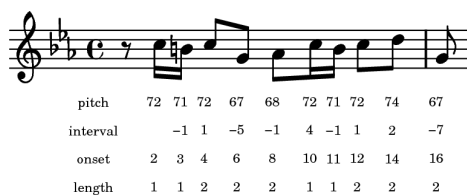
Fig. 1. A monophonic sequence of notes (start of Fugue #2, see Fig. 2), represented by (p, o, \ell) or (\Delta p, o, \ell) triplets. In this example, onsets and lengths are counted in sixteenths, and pitches and intervals are counted in semitones through the MIDI standard.