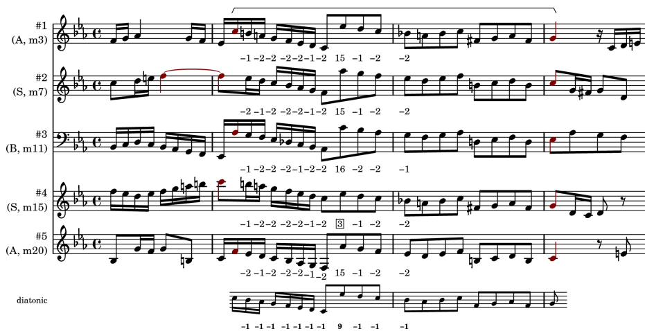
Fig. 4. The 5 complete occurrences of the first counter-subject into Fugue #2 in C minor (BWV 847). (Note that this counter-subject actually has a latter occurrence, split between two voices.) In these occurrences, all notes – except the first and the last ones – have exactly the same length. The values in the occurrences indicate the intervals, in number of semitones, inside the counter-subject. Only occurrences #2 and #5 have exactly the same intervals. The occurrence #4 is almost identical to occurrence #1, except that it lacks the octave jump (+3 instead of +15). Between groups {#1, #4}, {#2, #5}, and {#3}, the intervals are not exactly the same. However, all these intervals (except the lack of the octave jump in #4) are equal when one considers only diatonic information (bottom small staff): clef, key and alterations are here deliberately omitted, as semitone information is not considered.

in the first book of Bach’s Well-Tempered Clavier , we notice that g is always between -8 and +6 , and, in the majority of cases, between -4 and +1 .