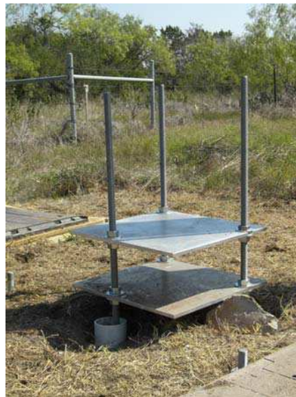
Figure 5. Edwards Aquifer field site monument installation. Plates and long rods were removed after the epoxy cement had cured. Shorter rods were installed and the plates were replaced to form bracing for the vertical rods. Finally, aluminum pillars were threaded to the top of the steel rods, and E2 lowered onto them. The last step involved erecting the instrument shed around E2.