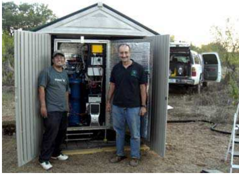
Figure 6. Instrument shed containing E2, during installation November, 2008. A similar shed behind this contains E1. A portable air conditioner in the E1 shed provided cool air for the refrigerator compressor, and was ducted to the E2 shed to cool electronics and the computer. Sheds were covered in reflective insulation to reduce heat load from the sun.