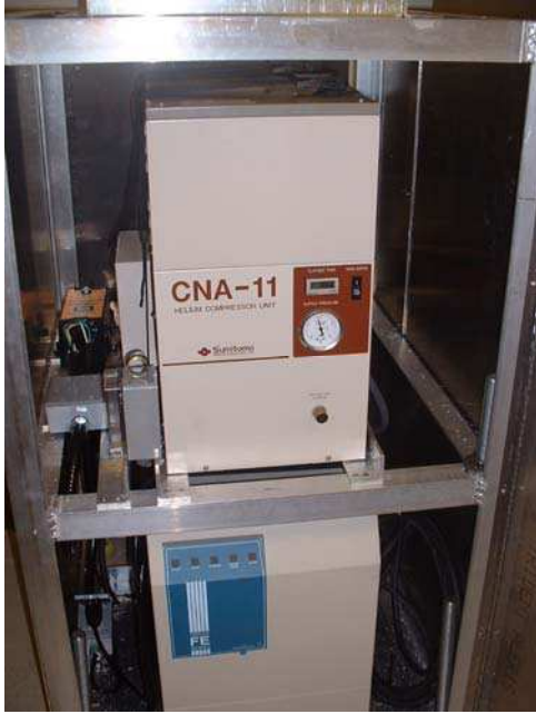
Figure 1. Interior of enclosure E1, containing UPS and refrigerator. Lightning surge protector and thermostatic control for the top-mounted cooling fan are located at mid-level.

The cold head frame is secured to the base of E2 with vibration isolation mounts, and the dewar containing the SG sensor is supported on 3 aluminum pillars. When installing on a concrete floor, the pillars are bolted to an aluminum plate. Installation involves raising E2, sliding the pillar-plate assembly beneath it, and lowering E2 as the 3 pillars pass through clearance holes to support the dewar. During the field trial, the pillar plate assembly was replaced by braced threaded rods cemented into outcropping limestone (Figure 5) with the 3 aluminum pillars threaded onto the rods.