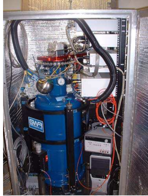
Figure 2. Interior of enclosure E2 showing helium dewar, cold head and cold head frame with rack mounting of most electronics at right.

A portable air conditioning unit supplied cool air to the base of E1, with hot air exhausted from the top E1 to the shed exterior. A fan and duct connecting the two instrument sheds circulated cool air to E1. These systems worked well, although additional reflective insulation on the exterior of the sheds was required to reduce heat load from the sun.