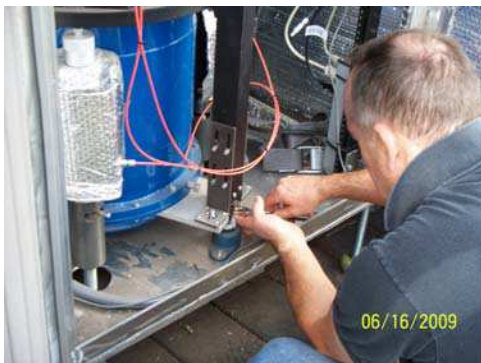
Figure 3. Securing the base of the dewar to the cold head frame with brackets allows E2 to be transported without disassembly.

The cold head frame is secured to the base of E2 with vibration isolation mounts, and the dewar containing the SG sensor is supported on 3 aluminum pillars. When installing on a concrete floor, the pillars are bolted to an aluminum plate. Installation involves raising E2, sliding the pillar-plate assembly beneath it, and lowering E2 as the 3 pillars pass through clearance holes to support the dewar. During the field trial, the pillar plate assembly was replaced by braced threaded rods cemented into outcropping limestone (Figure 5) with the 3 aluminum pillars threaded onto the rods.