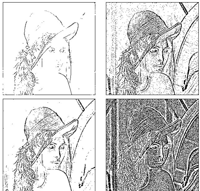
Fig. 4. CLIP(top left), SLIP (top right), HLIP (bottom left) and Pseudo-LIP (bottom right) Laplacians of Lena image thresholded with the Otsu method.

are shown in fig. 4. The CLIP Laplacian segmentation doesn't exhibit any effective detection in the image. Then, it appears clearly that there is an increase in level of detection for each model, due to the different thresholds automatically founds with the Otsu method. The HLIP Laplacian segmentation fails to detect all edges, as the thresholded image doesn't exhibit all reflections of Lena's hat in the mirror. On the contrary, The Pseudo-LIP Laplacian segmentation exhibits a lot of noise. The SLIP Laplacian segmentation image is a compromise between edges and noise detection and will be more usable for binary mathematical morphology operations.