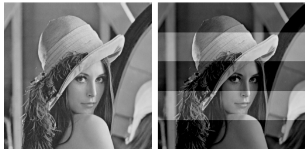
Fig. 2. Original Lena image (left) and Lena image viewed through a light intensity filter (right). The filter consists in 3 horizontal bands of 25% light absorption..

This property is important, because images of different types can be processed together with the SLIP framework. The result of a reflected image passed through a light intensity filter can be calculated; for example an eye viewing a scene through a slide, as shown in fig. 2. In this example, the filter consists in 3 horizontal bands of 25% light absorption, i.e. a value