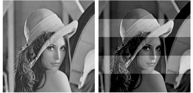
Fig. 2. Original Lena image (left) and Lena image viewed through a light intensity filter (right). The filter consists in 3 horizontal bands of 25% light absorption..

This property is important, because images of different types can be processed together with the SLIP framework. The result of a reflected image passed through a light intensity filter can be calculated; for example an eye viewing a scene through a slide, as shown in fig. 2. In this example, the filter consists in 3 horizontal bands of 25% light absorption, i.e. a value