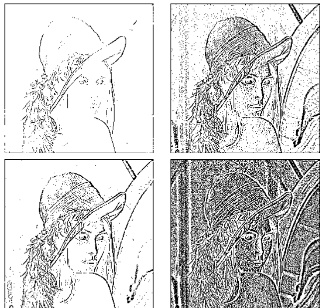
Fig. 4. CLIP(top left), SLIP (top right), HLIP (bottom left) and Pseudo-LIP (bottom right) Laplacians of Lena image thresholded with the Otsu method.

are shown in fig. 4. The CLIP Laplacian segmentation doesn't exhibit any effective detection in the image. Then, it appears clearly that there is an increase in level of detection for each model, due to the different thresholds automatically founds with the Otsu method. The HLIP Laplacian segmentation fails to detect all edges, as the thresholded image doesn't exhibit all reflections of Lena's hat in the mirror. On the contrary, The Pseudo-LIP Laplacian segmentation exhibits a lot of noise. The SLIP Laplacian segmentation image is a compromise between edges and noise detection and will be more usable for binary mathematical morphology operations.