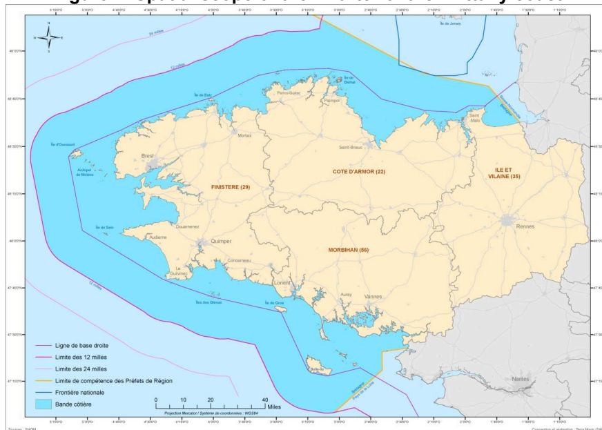
Figure 1. Spatial scope of the Charter of the Brittany coast

The Charter of Brittany Coast considers all the territory of Britain as a coastal area. Therefore, the spatial scope of our study encompasses the four departments on land, and the marine boundaries to a limit of 12 miles (Figure 1).