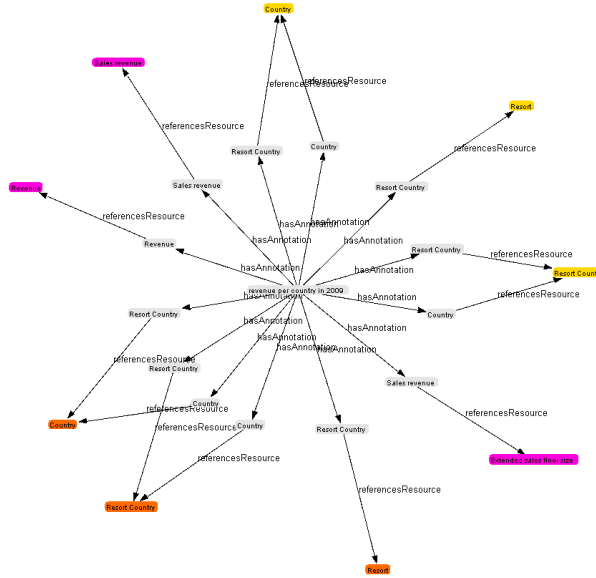
FIG. 2 – Example of parse tree generated for the question “Revenue per country in 2009”