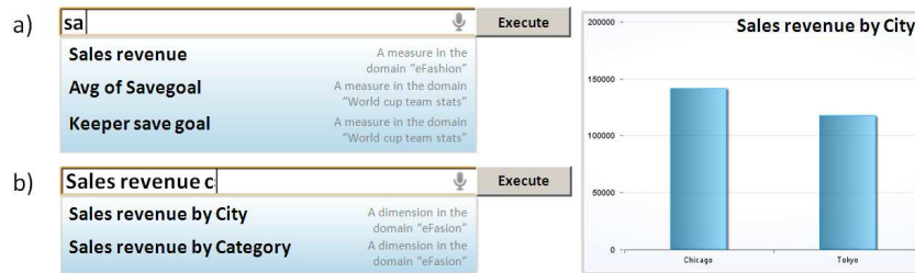
Fig. 3. Screenshot of auto-completion used in an interactive query designer. (a) First suggestions after characters “sa” and (b) suggestions following the selection of measure Sales revenue and character “c”. On the right is a sample visualization that can be built with the query Sales revenue by City .

To conclude with the notation of the query expansion problem introduced in Section 1, we define our component QE as: