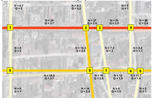
Fig.5. Illustration of the real-time graph model.

A 2D graph may also be used to represent this model. Its edges and vertices have attributes that include real-time data. A timer must be defined, in order to trigger the refreshment or the deletion of real-time data. The following figure shows a representation of this real-time graph model.