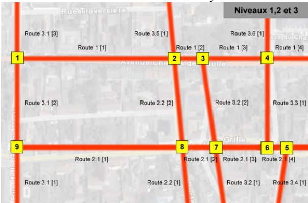
Fig.3. Illustration of the hierarchical graph model – levels 1, 2 and 3.

Semantic information implies a hierarchy between the different information it includes. Therefore, the graph's edges name must take into account this hierarchy.