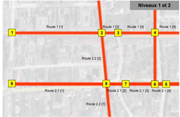
Fig.4. Illustration of the hierarchical graph model – levels 1 and 2.

network, as showed in the following figure.