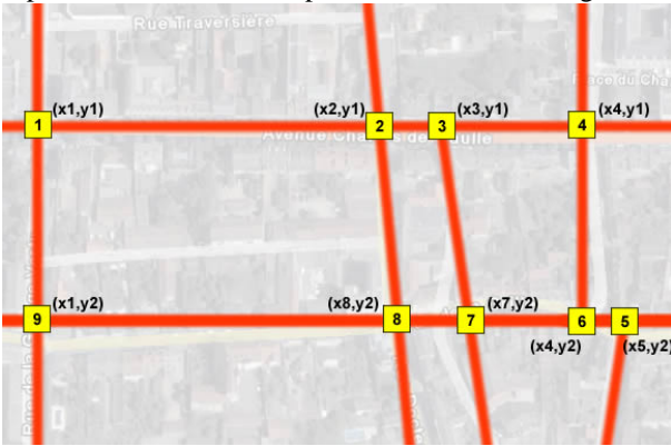
Fig.2. Illustration of the flat graph model

start and the end points, the model returns the shortest path between these two points, as well as its length.