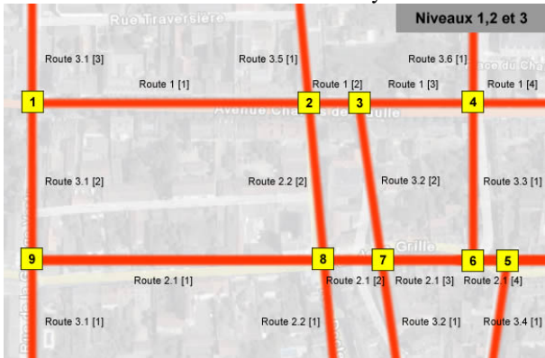
Fig.3. Illustration of the hierarchical graph model – levels 1, 2 and 3.

Semantic information implies a hierarchy between the different information it includes. Therefore, the graph's edges name must take into account this hierarchy.