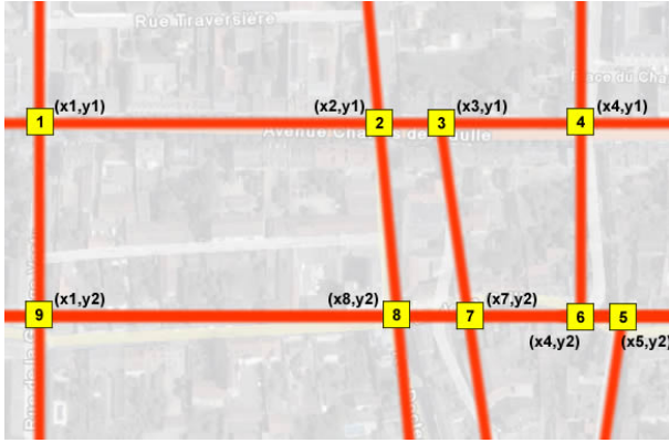
Fig.2. Illustration of the flat graph model

start and the end points, the model returns the shortest path between these two points, as well as its length.