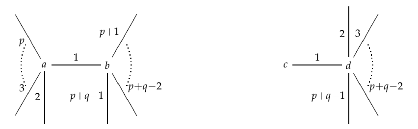
Figure 1 Figure 2

Proof. (1) The algebra \Lambda(p,q;s,t) is the generalised Brauer tree algebra associated to the Brauer tree in Figure 1: