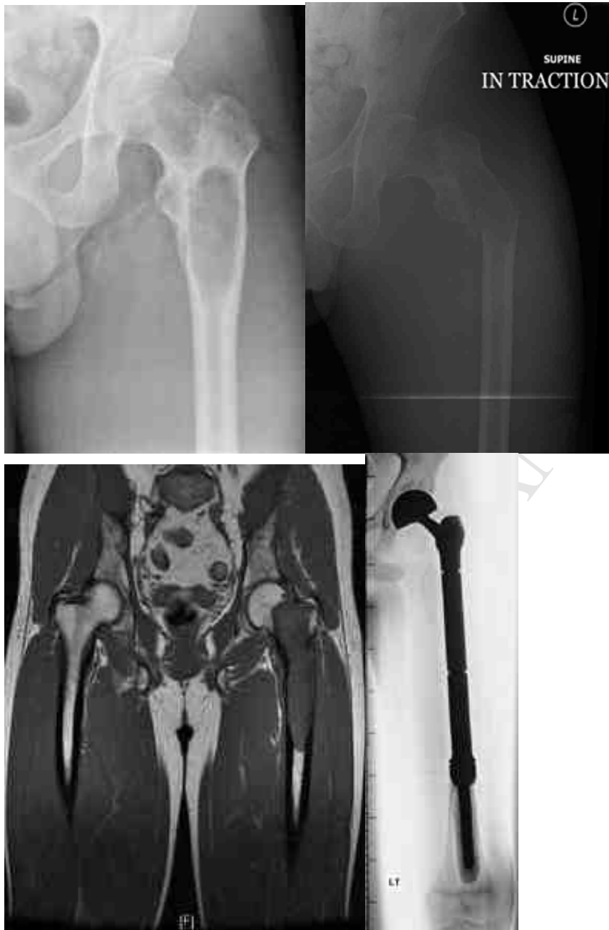
Figure 1 - Pre operative radiographs, MRI scan of chondrosarcoma of the proximal femur and post operative radiograph showing proximal femoral endoprosthesis