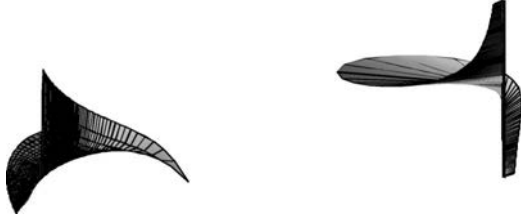
FIGURE 1. Scherk minimal surface invariant by hyperbolic translation and its conjugate in \mathbf{H}^2 \times \mathbf{R} .

REMARK 17. Assume that \mathbf{M} = \mathbf{R}^2 , and consider X, X^* : \Omega \rightarrow \mathbf{R}^2 \times \mathbf{R} two conformal minimal immersions. Let (g, \eta) (resp. (g^*, \eta^*) ) be the Weierstrass representation of X (resp. X^* ). We know that X and X^* are associate in the usual sense, that is, in the Euclidean space \mathbf{R}^3 , if and only if g^* = g and \eta^* = e^{i\theta}\eta for a real number \theta . Set X = (h, f) and X^* = (h^*, f^*) . Since Q(h) = -(\eta)^2/4 , we see that if X and X^* are associate in the usual sense, then there are associate in the meaning of Definition 8. Conversely, assume that X and X^* are associate in the sense of Definition 8. Then we have \eta^* = \pm e^{i\theta}\eta and |g^*| = |g| or |g^*| = 1/|g| . Therefore, there exists an isometry \Gamma of \mathbf{R}^3 such that X and \Gamma \circ X^* are associate in the usual sense.