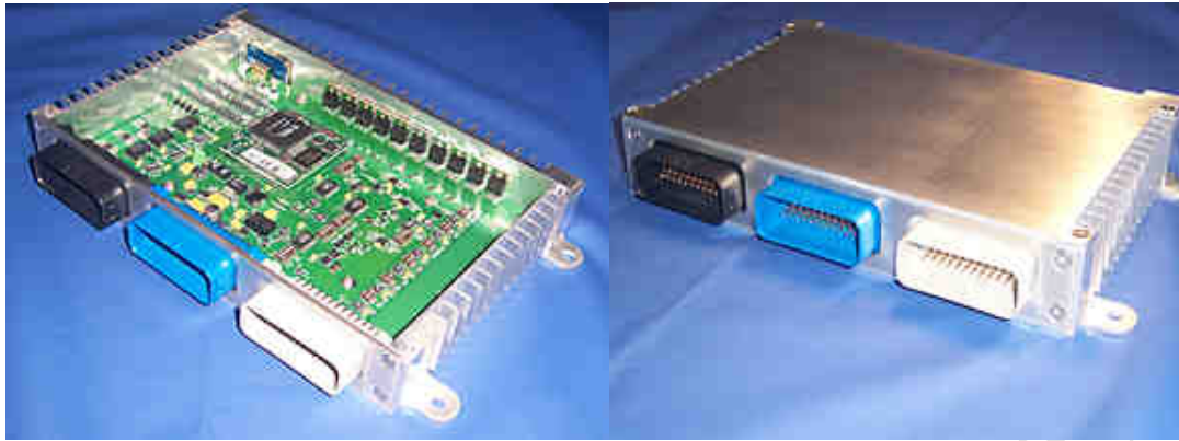
Figure 1: A custom made automotive ECU, without top plate (on the left) and assembled view (on the right) [4].