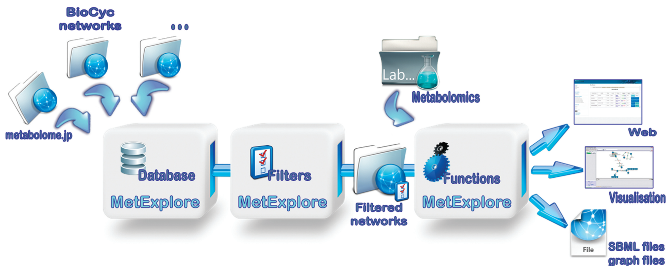
Figure 1. MetExplore work flow.

Each MetExplore function returns a web browsable table and allows visualization of the results through the graph visualization tool, Cytoscape (19). Each filtered