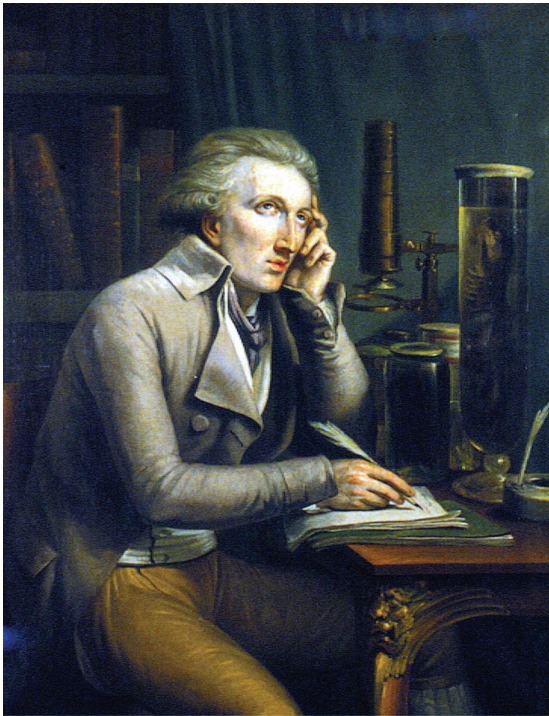
FIGURE 2. Jean Léopold Nicolas Frédéric CUVIER, known as Georges Cuvier (1769 Montbéliard - 1832 Paris), who established the scientific disciplines of comparative anatomy and paleontology. Portrait by Matheus van Bree.

Alexandre Brongniart (1770-1847) was a mineralogist, geologist, zoologist and paleontologist, and is considered, together with Cuvier, as one of the founders of stratigraphic paleontology. His son, Adolphe Théodore Brongniart (1801-1876) is clearly considered to be the originator of the discipline of paleobotany in France, as he followed and adapted the studies of Kaspar Maria Sternberg (1761-1838) in Bohemia and Ernst Friedrich von Schlotheim (1765-1832) in Germany. A.T. Brongniart published the first classification and distribution of fossil plants, with comparisons to their nearest recent relatives, in his Histoire des végétaux fossiles (1828-1837).