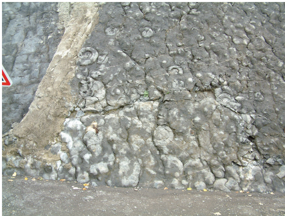
FIGURE 1. The "dalle à ammonites" is the most famous fossil locality of the Réserve Naturelle Géologique de Haute Provence. A slab of 320 m 2 shows 1550 ammonites of the species Coroniceras multicosatum, up to 70 cm in diameter, indicating an early Jurassic age.

gen (Germany), he left for Stuttgart where he studied natural sciences. He moved to France where he got a professorship at the Muséum National d'Histoire Naturelle (MNHN) in 1802. He presented his first paleontological studies at the Académie des Sciences since 1796, establishing the widely used concept of "catastrophism". With his four volumes on the Recherches sur les ossements fossiles de quadrupèdes , published in 1812, Cuvier can be considered as the originator of vertebrate paleontology. It was also Cuvier who first defined the Jurassic as a geological period.