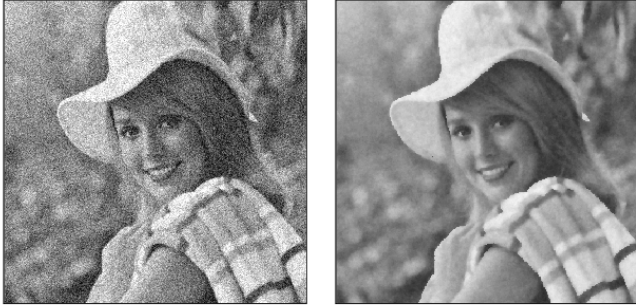
Fig. 2. Noisy image with SNR=15 dB, MSSIM = 0.59, \sigma_u = 25.2 (left) and denoised image (right) with MM-MG algorithm using \lambda = 2028 , \delta = 30 , SNR=24.4 dB, MSSIM = 0.87.