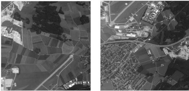
Fig. 2. Subscenes of the hyperspectral image showing the DLR facilities (Band 7).

where N is the number of images in the dataset, and d_{ij} is the NCD distance between images H_i and H_j . Then, the matrix D of NCD distances can be used as the input to a classifier. Although we make emphasis here in hyperspectral imagery, this methodology is easily modifiable for the analysis of other RS data. It is also to be noted that the analysis of the RS images by this methodology allows to use the image as a whole, independently of their size.