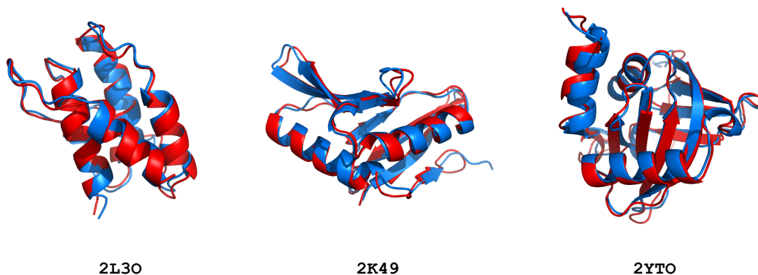
Fig. 2. Superimposition of structures determined by SPROS in blue and the reference structures in red.