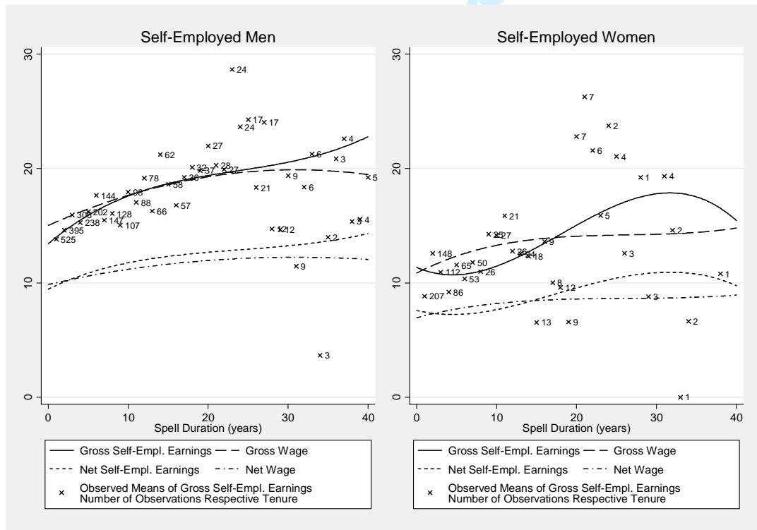
Figure 2: Predicted Hourly Earnings of the Self-Employed (Euros)