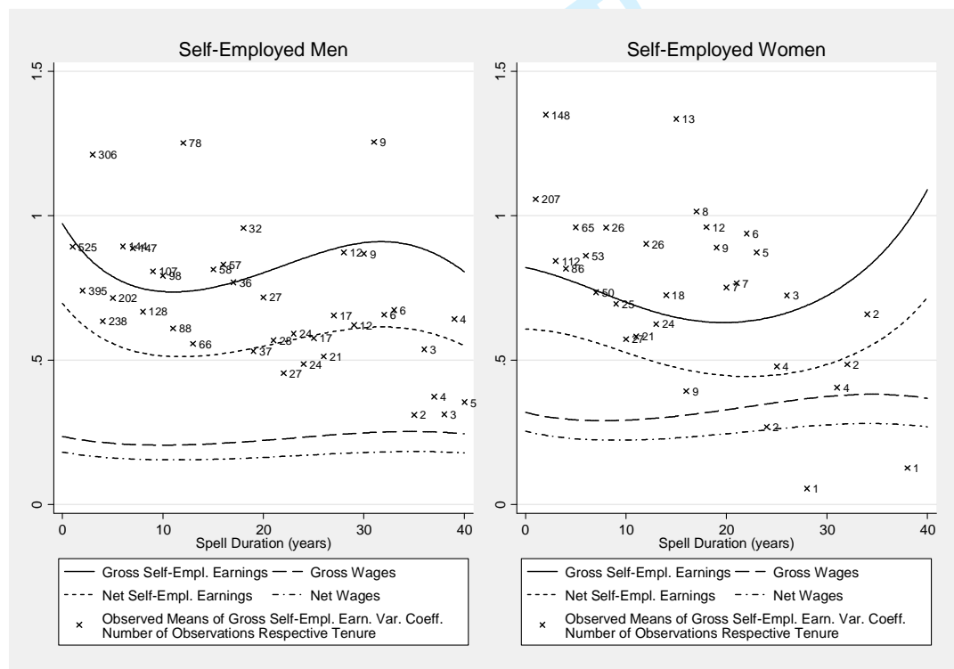
Figure 4: Predicted Variation Coefficient of Hourly Earnings of the Self-Employed