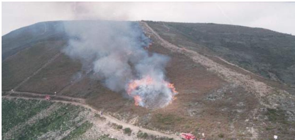
Figure 2. Image of the Gestosa experiments.