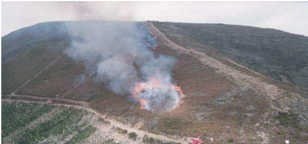
219x103mm (72 x 72 DPI)

1 2 3 4 5 6 7 8 9 10 11 12 13 14 15 16 17 18 19 20 21 22 23 24 25 26 27 28 29 30 31 32 33 34 35 36 37 38 39 40 41 42 43 44 45 46 47 48 49 50 51 52 53 54 55 56 57 58 59 60