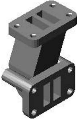
Fig.2. The part to be machined

Eight holes are machined in the part (Fig. 2). Operations for machining the holes and their parameters are given in Table 1; T_0=3 min; t^p = t^g = t^l = 0.1 min; m_0=6 ; b_0=4 ; C_1=10 ; C_2=5 ; C_3=2 ; C_4 = 3 . Precedence constraints, exclusion constraints for blocks and positions are presented in Tables 2, 3 and 4, respectively. Inclusion constraints for blocks are given in Table 5. All the constraints were generated by decision support system (Dolgui et al, 2009a).