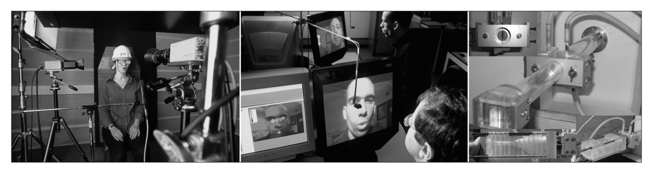
Figure 2 : Experimental platforms available at the Speech and Cognition Department of GIPSA-lab. Left panel: Stendhal experimental unit. Middle panel: MICAL unit. Right panel: Aeroacoustic unit.