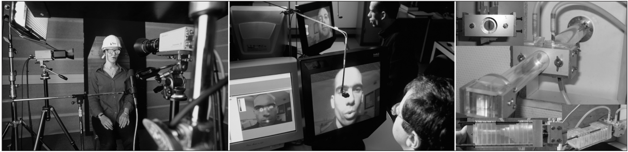
Figure 2: Experimental platforms available at the Speech and Cognition Department of GIPSA-lab. Left panel: Stendhal experimental unit. Middle panel: MICAL unit. Right panel: Aeroacoustic unit.