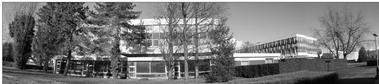
Figure 1. GIPSA-lab, a multidisciplinary research laboratory on signals and systems in the French Alps.