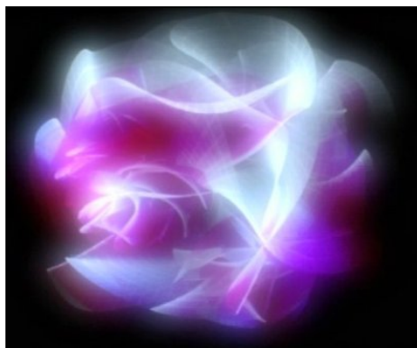
FIGURE 2 – Une variété de Calabi Yau

For n = 3 , we have the three points correlation function or "pant" : n = 3 , \langle [H], [H], [H] \rangle_\beta , basic "lego" of topological fields theory .