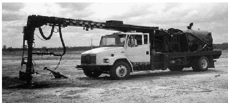
Figure 1: An example of a MOR vehicle.

The MOR unit is an artificial lift system which is used to exploit wells whose production is marginal. It consists of a truck (vehicle unit) equipped with an apparatus, see Figure 1. Considering a working day, the unit starts its tour at the depot, then it pumps several wells before returning to the depot. At each well, the driver spends some time to connect the unit to the well, to pump the oil and to disconnect the equipment. Whenever the unit's tank is full, an auxiliary vehicle is used to transfer the oil from the MOR unit to its own tank and to carry it back to the depot. Thus, the MOR unit does not need to stop its operations and its capacity can be considered unlimited.