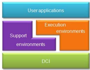
Figure 1. Complementarity of support and application execution environments

adoption in fragmented communities with heterogeneous requirements. Secondly, they hide technical issues but do not solve them. In particular, a technical issue may affect only a single VO, and it may last endlessly unless someone from that VO manually points it out (e.g. quota policies, authentication issues, or misconfigurations). Consequently, a longer-term, VO-specific but application-independent support activity is needed. This support should act on behalf of a large community of users and applications, to ensure a sustained quality of service at the grid infrastructure level. The complementarity of application execution and support environments is illustrated in Figure 1. Within the Life Science Grid Community<sup>1</sup> (LSGC), dozens of independent users applications generate all kinds of computing tasks. There is no control on the type of grid usage, and the use of a single execution environment that could simplify VO management is not possible.