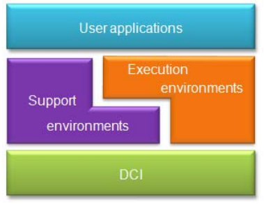
Figure 1. Complementarity of support and application execution environments

adoption in fragmented communities with heterogeneous requirements. Secondly, they hide technical issues but do not solve them. In particular, a technical issue may affect only a single VO, and it may last endlessly unless someone from that VO manually points it out (e.g. quota policies, authentication issues, or misconfigurations). Consequently, a longer-term, VO-specific but application-independent support activity is needed. This support should act on behalf of a large community of users and applications, to ensure a sustained quality of service at the grid infrastructure level. The complementarity of application execution and support environments is illustrated in Figure 1. Within the Life Science Grid Community<sup>1</sup> (LSGC), dozens of independent users applications generate all kinds of computing tasks. There is no control on the type of grid usage, and the use of a single execution environment that could simplify VO management is not possible.