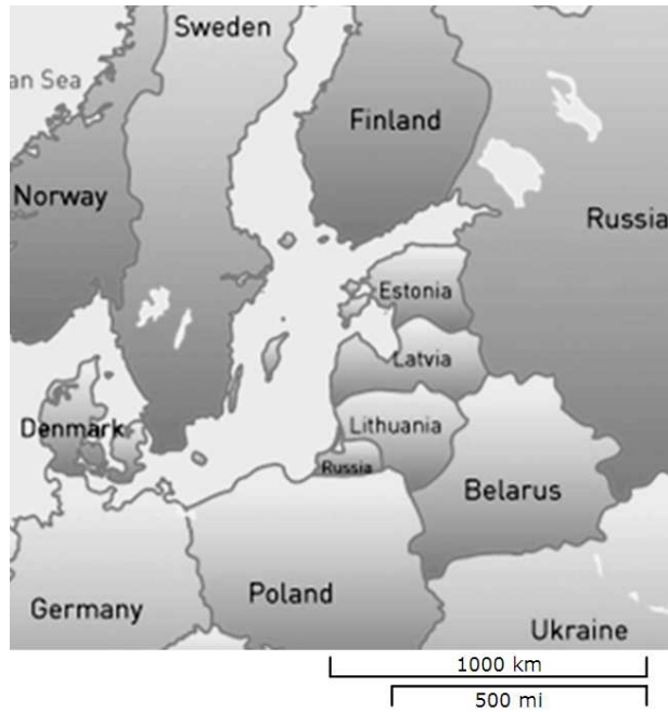
Figure 1. Latvia: key information