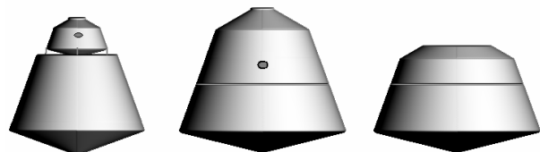
Fig. 2: ERV, manned spacecraft and cargo during Earth-Mars transit. The shape of the vehicles is adapted for aerocapture or/and landing.

• Finally, another interesting feature is that the ERV, the cargo and the manned spacecraft would have a similar mass. In order to send all the spacecrafts to Mars, the same launcher might be used with a reasonable IMLEO capability. An illustration of the payloads is proposed Fig. 2.