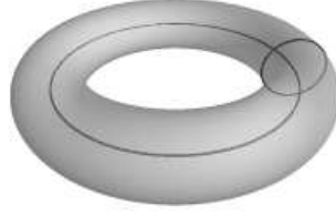
FIGURE 2. Cell structure of the 2-torus

Proof. Consider the cellular decomposition of \Gamma \backslash \mathcal{H} with only 3-cell the Bianchi fundamental polyhedron. Consider the chain map induced by including the boundary \partial(\Gamma \backslash \widehat{\mathcal{H}}) as a sub-cellular chain complex into the Borel–Serre compactification \Gamma \backslash \widehat{\mathcal{H}} . As a sub-chain inclusion, this chain map is injective and preserves cycles. So we only have to divide out the boundaries in \Gamma \backslash \widehat{\mathcal{H}} . In degree n , we carry this out applying theorem 2 ( n ). \square