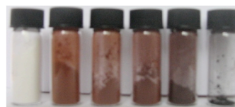
T 25°C 200 240 270 300 300 (2 hours)