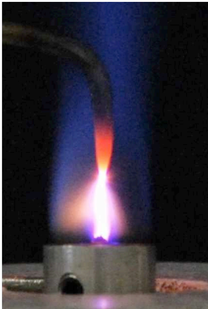
Fig. 1. Nanosecond Repetitively Pulsed plasma discharge (spark), without flame (left) and interacting with a lean flame (right). Characterization of the discharge: f = 30 \text{ kHz} , V = 6.0 \text{ kV} .