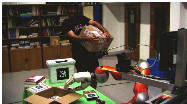
Fig. 1. Interacting with the robot in an everyday setup: the human asks for help in vague terms, the robot takes into account the human’s spatial perspective to refine its understanding of the question.

This implies first to understand the semantics of the sentence: What does “ Jido ” refers to? What is “ give ”? What is “ me ”? And “ the tape ”? Working in a situated context, we want furthermore to resolve these semantics atoms, i.e. , ground them in the sensory-motor space of the robot. For instance, in this context “ tape ” refers to an artifact of type VideoTape that is