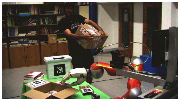
Fig. 1. Interacting with the robot in an everyday setup: the human asks for help in vague terms, the robot takes into account the human’s spatial perspective to refine its understanding of the question.

This implies first to understand the semantics of the sentence: What does “ Jido ” refers to? What is “ give ”? What is “ me ”? And “ the tape ”? Working in a situated context, we want furthermore to resolve these semantics atoms, i.e. , ground them in the sensory-motor space of the robot. For instance, in this context “ tape ” refers to an artifact of type VideoTape that is