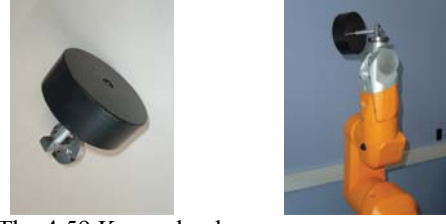
Fig. 2. The 4.59 Kg payload

The manufacturer's drive gains ( Case 1 ) and the identified ones ( Cases 2 ) are given in table 3. For each joint, the